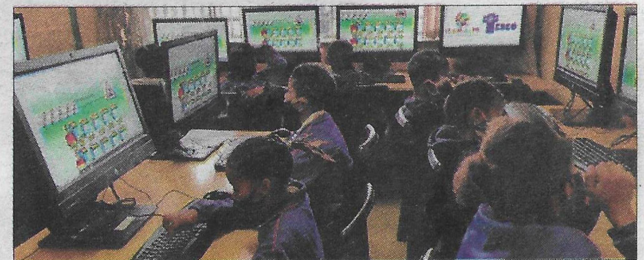
■ Right: The pupils in the computer class.

What excitement and wonder at the incredible sights.